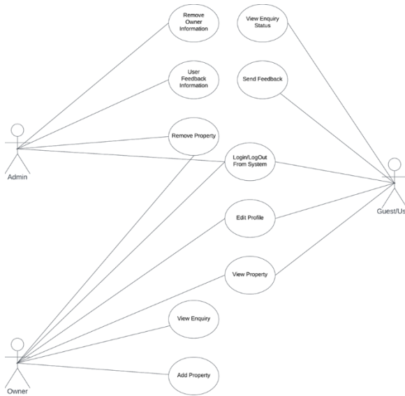
Fig 3.2- Use-case diagram