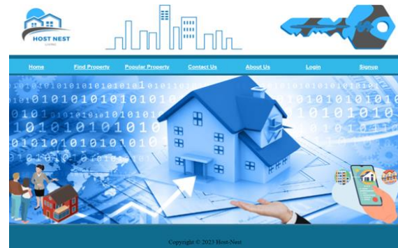
Fig 5.1- Home page