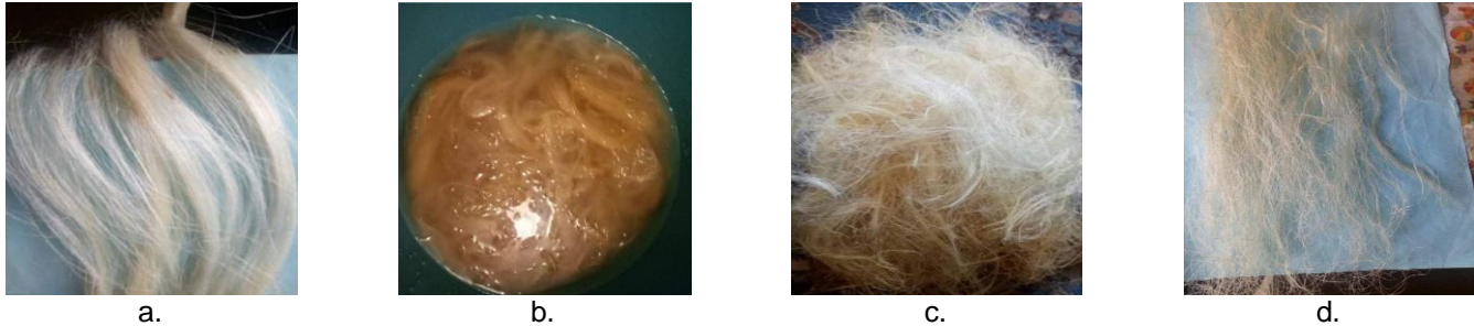
Fig. 1: Alkali treatment of kenaf fiber process

In order to ensure good adhesion with the epoxy resin (hydrophobic), the kenaf fibers were treated in an alkaline medium (Figure 1). At the beginning, a quantity of sodium hydroxyl NaOH was prepared in a bath of water (5 L) where its concentration was 6%. After 48h of impregnation, the treated fibers were washed with distilled water until the pH became neutral (PH=7). The treated fibers were dried in the oven at a temperature of 50° for 5 hours. A unidirectional arrangement was adopted with an areal density of 600 g/m 2 , where the average fiber length was 250 mm.