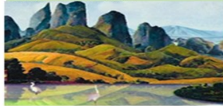
Figure 4 Authors' Interpretative Framework for Gucci Chengdu Video.

Argument - The argument associated with the landscape constitutes the narrative that the combination of elements is telling. It is the visual and communicative expression seeking to create a unique atmosphere, connecting seemingly different elements to narrate the story of the Gucci brand and its connection with two distinct locations.