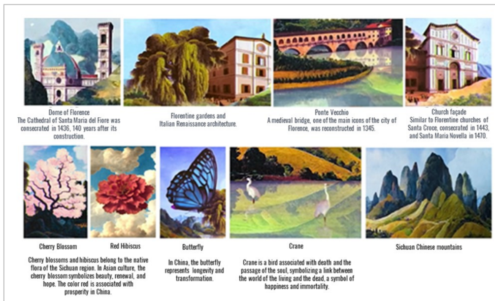
Figure 2 Figure 2 - Elements from the digital fresco video of the Gucci Chengdu Store.

of creating heritage (Pecot & Barnier, 2017; Hakala et al., 2011). The use of visual symbols, blending history and enduring values, is especially important in the innovation processes of luxury brands to enhance brand positioning and value propositions (Sammour et al., 2020). The video created by Generative Artificial Intelligence (GAI) for the new Gucci Chengdu store's digital fresco merges Italian and Chinese cultures. It depicts Florentine architecture and Italian Renaissance landscapes alongside the natural scenery of Sichuan, the Chinese region where Chengdu is located. Despite Chengdu's modern urban setting, the brand chooses to portray dreamlike landscapes from Sichuan's interior.