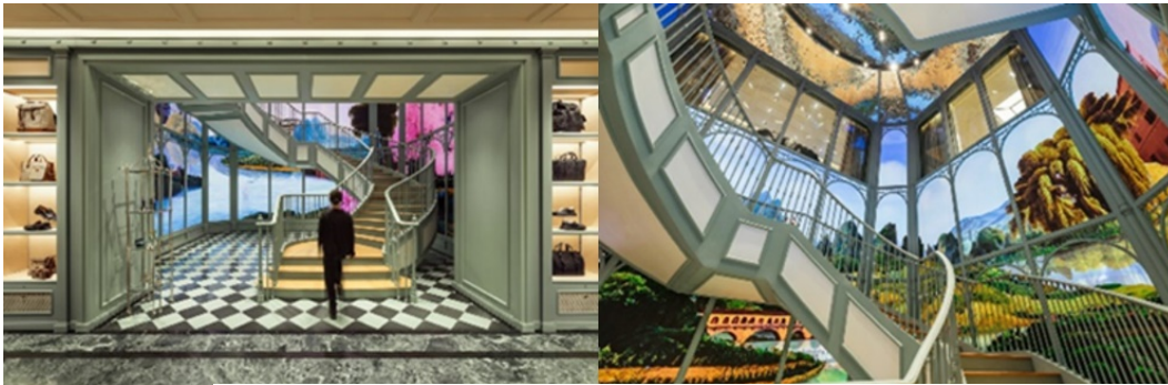
Figure 1 Figure 1 - Images of the Gucci Chengdu Store with the digital fresco created through Generative Artificial Intelligence. Retrieved: November 20, 2023 - Source https://frameweb.com/article/retail/is-ai-the-key-to-a-dynamic-retail-experience-see-this-ran

and making it an epicenter for sustainable growth. This reshapes the global luxury landscape and triggers a profound reassessment of traditional market dynamics and cultural influence in the luxury universe. According to Bain Luxury Goods, the global luxury goods market analysis reveals continuous and significant growth, solidifying China as a crucial player (Lanne, 2018). Recognizing China's significance, Gucci opened a Chengdu store in June 2023, integrating AI to connect with new generations. The digital fresco, showcased on 33 LED panels, portrays landscapes of Chengdu and Renaissance architecture in Florence. The incorporation of new narratives and languages reflects the fashion industry's ability to express and create symbolic value in modern society (Meneguete, 2020). In the fusion of two cultures, Gucci introduces "remix culture," a digital interconnection reshaping creation, involving conscious choices of symbolic systems in media, where each fragment carries cultural, visual, and imaginative connections (Leão, 2012).