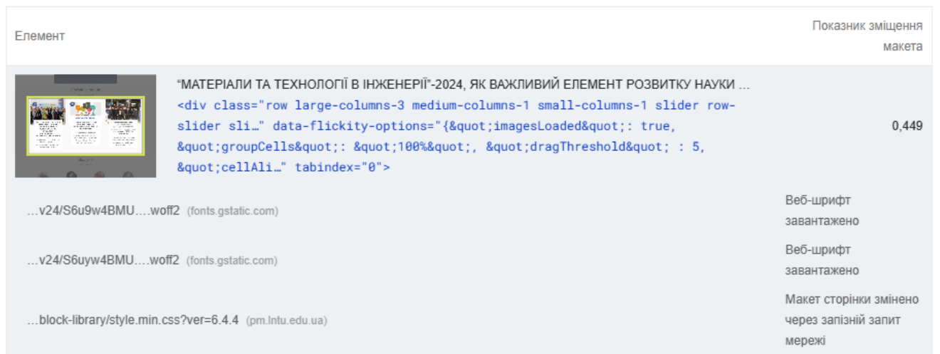
Fig. 4. Large layout shifts.

Need to reduce the number of WordPress plugins loaded per page (unnecessary CSS stylesheets). To identify plugins that add redundant CSS tables, you need to check the code coverage in Chrome DevTools. You can define a theme or plugin via a stylesheet URL. In code coverage, you need to find plugins with many style sheets by a large amount of red text. The plugin should set the stylesheet only if it is actually used on the page.