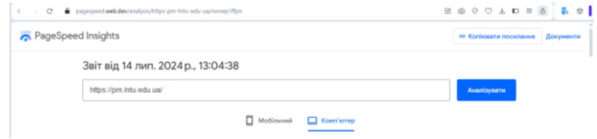
Fig. 1. Entering the URL of the site: https://pm.lntu.edu.ua/ .

Enter the URL of the website https://pm.lntu.edu.ua (Department of Applied Mechanics and Mechatronics) to be evaluated in the appropriate field and click the "Analyze" button (Fig. 1).