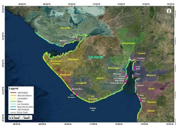
Figure 2 Shoreline of Gujarat

The coastal state of Gujarat is on the western end of Indian peninsula. It is longest coastline with geomorphic features, and based on the varied physiographic features, coastal processes and river discharge the coast can be broadly classified into five regions (1) The Rann of Kachchh (2) Gulf of Kachchh (3) The Saurashtra coast (4) Gulf of Khambhat and (5) The south Gujarat coast. The 1990-2016 shoreline change assessment result shows that 43% of the coast is stable, 31% is eroding and remaining 26% is accreting which is shown in figure. ( nccr.gov.in )