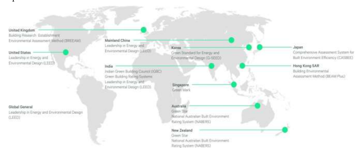
Figure 2.0 Green building certifications and standard agencies across the globe

The report also expects that further to the legislation, mandatory disclosure requirements and high energy prices will further incentivise property owners to adapt to green energy efficient initiatives at a property level to avoid possible penalties for non-disclosure requirements. This is also vital to ensure a transparent approach is taken to ESG reporting and the avoidance of greenwashing and inaccurate reporting of activities. It is also stated that hotel owners are aware of the possible financial savings of sustainable initiatives and the impact of non-action on brand reputation (CBRE,2023). For example, a recent policy document by Melia hotels on Climate Change and Environmental Policy outlined a series of initiatives at a group level overseen by the Board of Directors and its Sustainable Committee that has led to significant success in this area based on industry best practices as outlined by the Science Based Targets (2024)