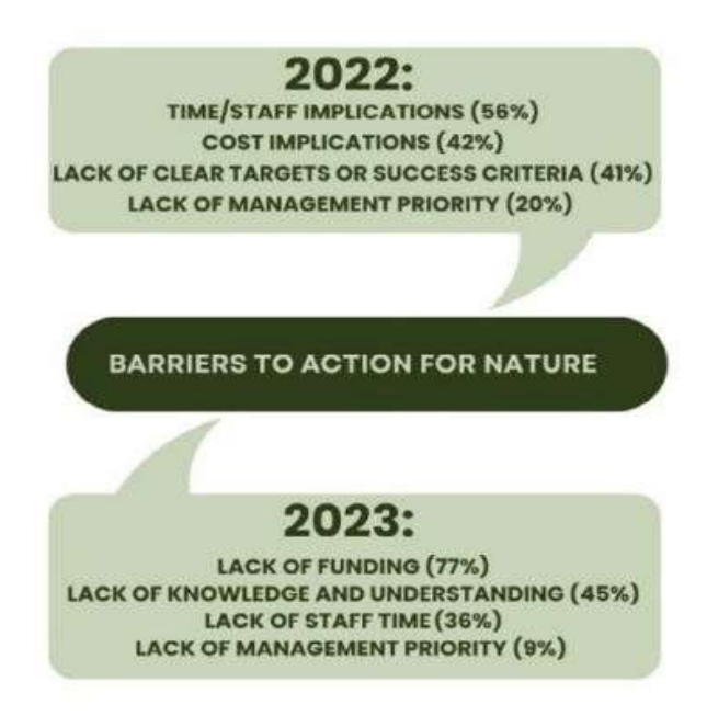
Figure 5.0 Barriers to Action for Nature 2022 & 2023 WTTC (2024)

The report also outlines based on their surveys the challenges that businesses face in achieving their nature positive goals. From figure 5.0 we can see the biggest change from 2022 to 2023 from respondents of the WTTC surveys has been the lack of funding to invest in sustainability, biodiversity, green technology, and their supply chains. In the UK, there are several funding schemes and grants made available for Tourism, travel and hospitality organisations that intend to adopt greener actions. This can vary from small- scale tourism infrastructure grants, grants for electric vehicle charging points and various funding grants from the UK Shared Prosperity Fund.