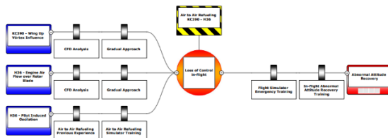
Figure 1. Bowtie referring to the event: Loss of Control in Flight.

Within the context of the topic addressed in this article, a risk analysis involving the combination of Safety I techniques was carried out to present a comparative basis with the Functional Resonance Analysis Method (FRAM). Through a Brainstorming involving pilots from the Institute of Research and Flight Test (IPEV) of the Brazilian Air Force (FAB), a risk event related to the REVO mission was chosen, raising its possible causes and consequences and proposing barriers to containment and mitigation. Thus, it was possible to assemble a Bowtie, as shown in Figure 1.