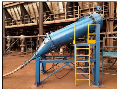
Figure 1: New developed pneumatic injection system.

Dense and heavy materials are usually conveyed pneumatically using a combination of silos and dispensers with high-pressure line. Lightweight (< 300 kgs/m 3 ) or low density shredded or powdered material (< 10 mm) such as in this case are difficult to convey through such systems and pipelines. Existing pressurized dispensers do not go well for conveying shredded plastic into Electric Arc Furnace as low-density materials such as shredded plastics, paper etc tend to adhere and form chunks or generate disperse motion inside the holding vessel, resulting in slowing down or stopping material discharge into the conveying line. The airflow passes through the material without moving it, forming a rat hole in the holding vessel. To overcome the difficulties faced during conveying and injecting shredded waste plastic, a new pneumatic conveying system for low-density shredded and powdered materials has been developed without the use of large silos and dispensers as shown in figure 1.