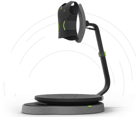
Figure 3: The new Virtuix Omni One VR treadmill [26]