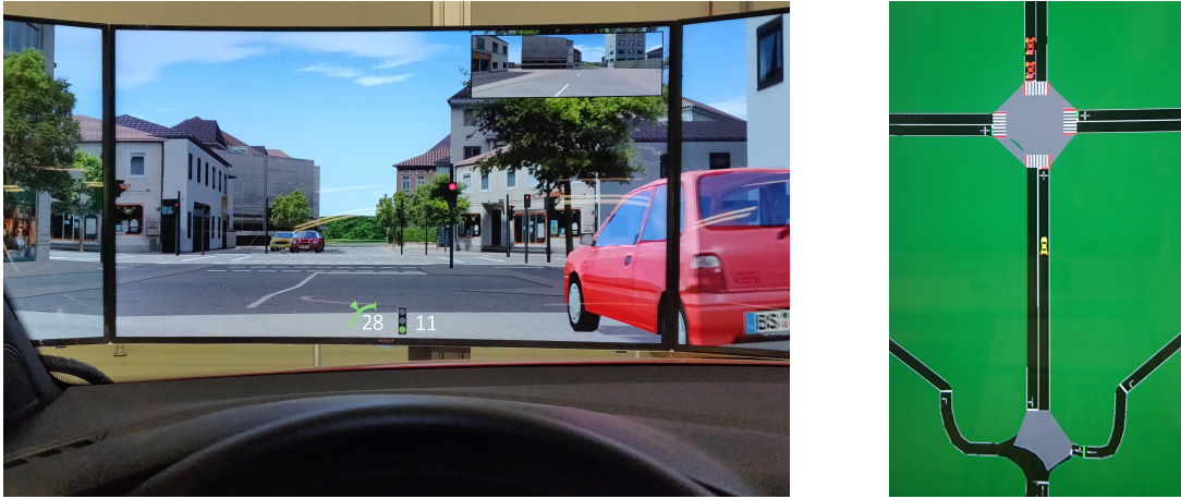
Figure 1: Driver view with the HMI in the simulator (left) and the corresponding SUMO visualisation (right) with the yellow ego-vehicle

vehicle free flow speed in urban environment should be between 30\text{km/h} and 50\text{km/h} . When the vehicle has received the signal state prediction, the expected earliest and latest arrival times at the stop line are estimated. From that, four cases can be differentiated: