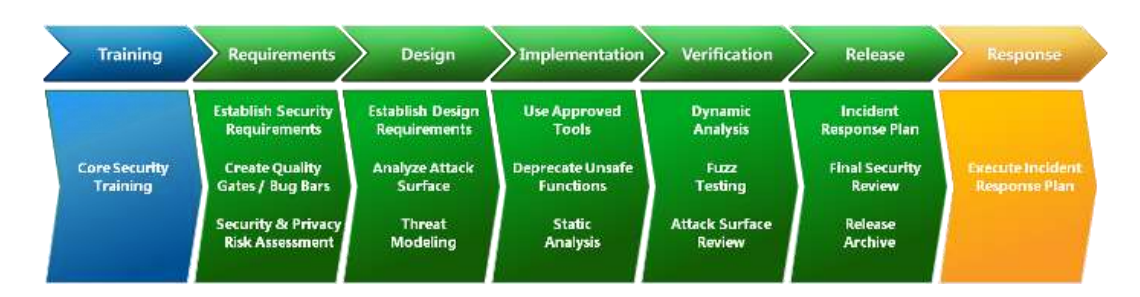
Figure 2: Microsoft's Security Development Lifecycle (SDL)